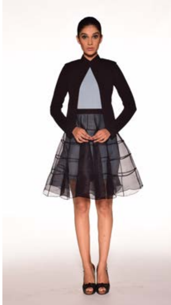
Plain blue short lycra dress layered with lycra jacket and pleated organza short skirt, both in black.