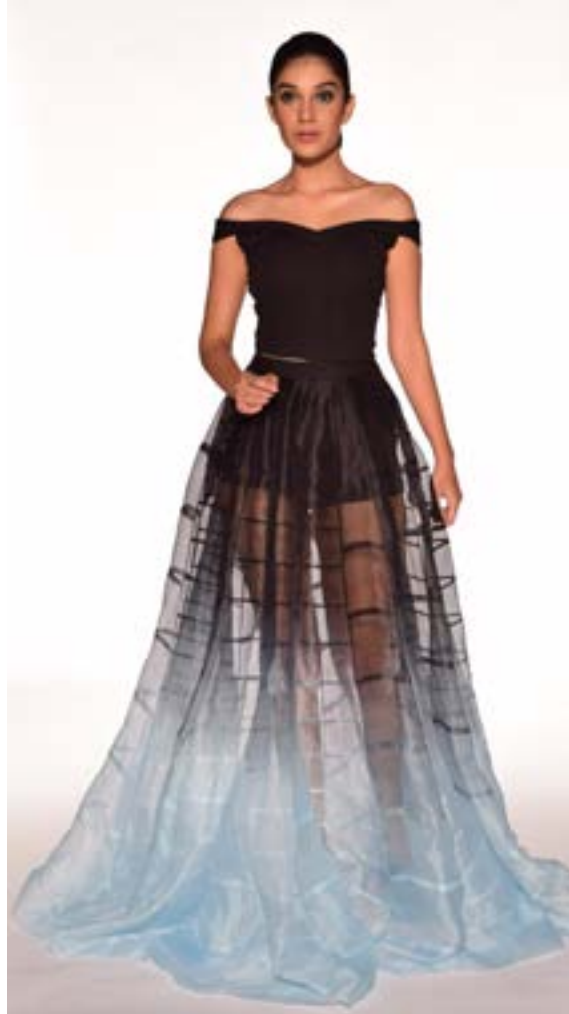
Black lycra hot shorts paired with an off shoulder black lycra top ; layered with an ombre dyed pleated organza long skirt.