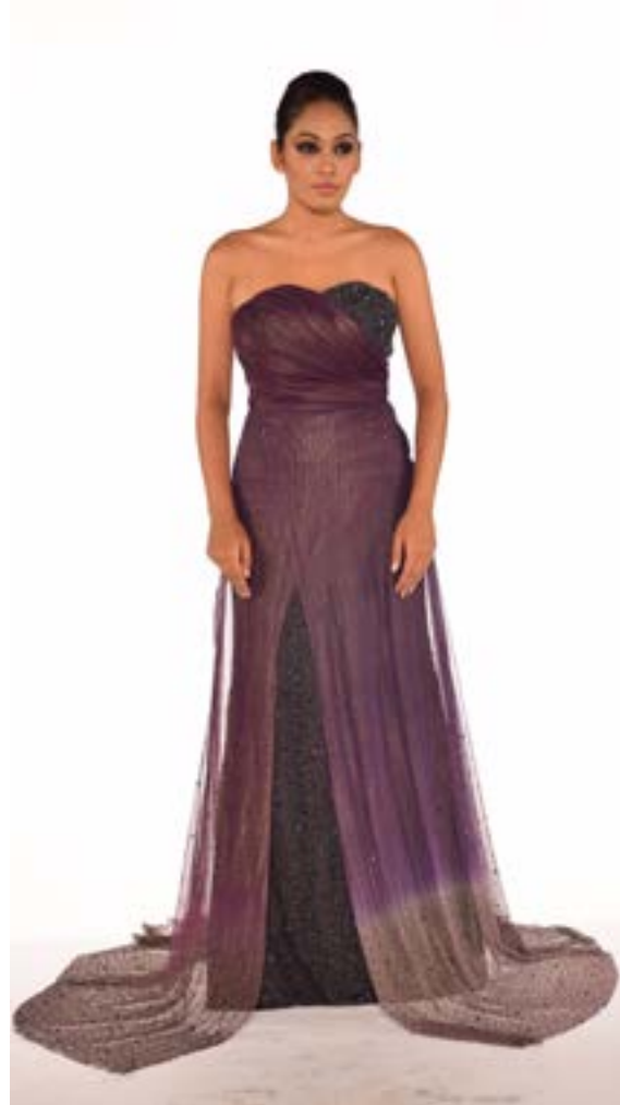
Grey A-line embroidered lace gown with corset top; Wrap-fishcut in shimmer net, eggplant to grey ombre with a trail and texturing on right side of the top.