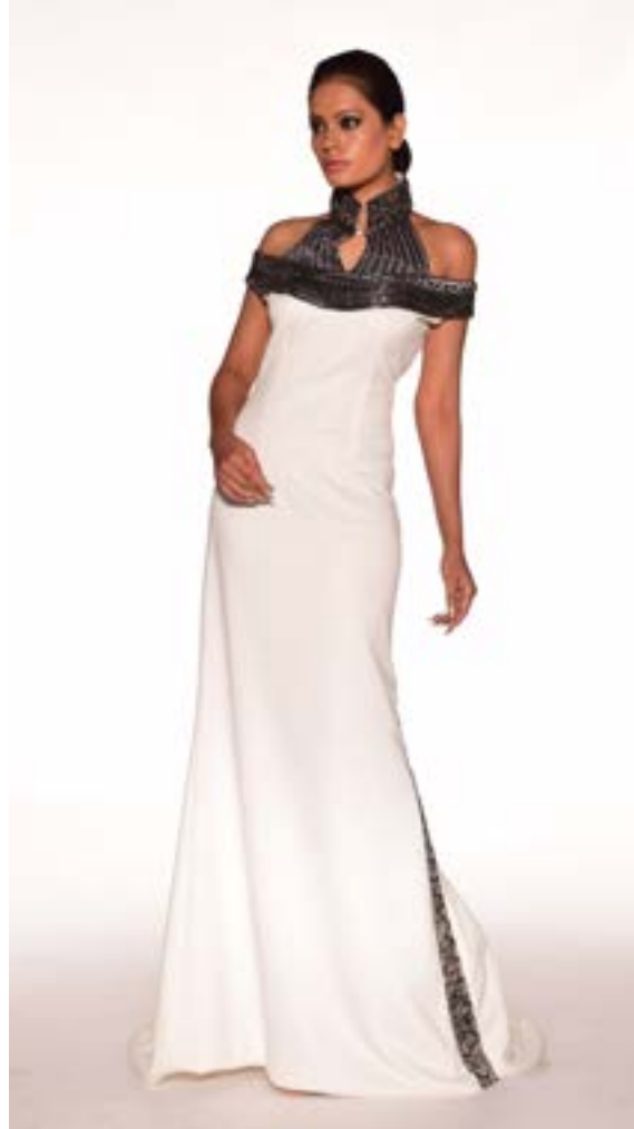
It consists of a Shoulder kissing gown blended with wide stand collar that fits like a glove. Heavy black metal embellished neckline mixed with milky white gown spells absolute luxury.