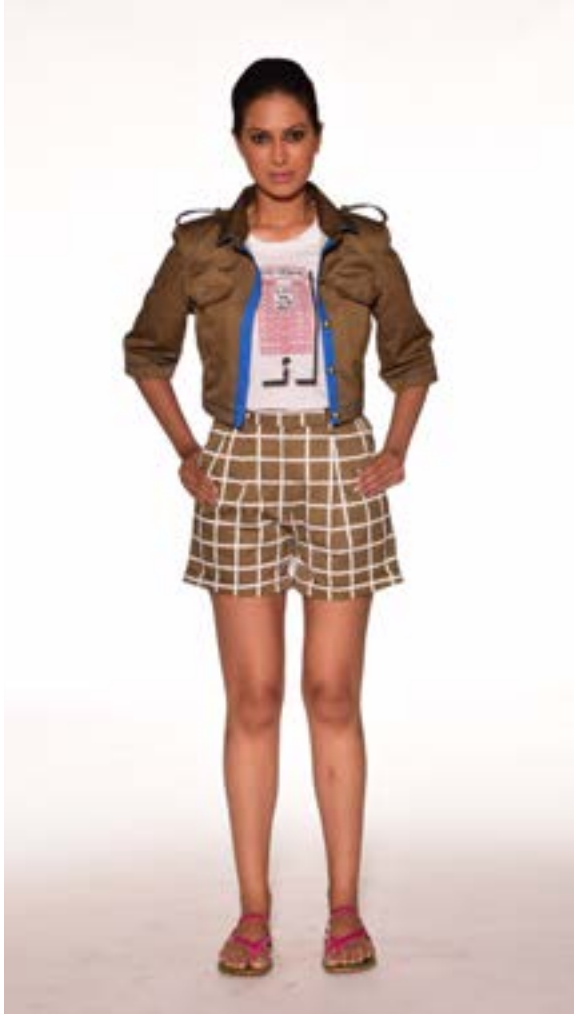
Khakhi crop shirt finished with blue trimmings paired with checkered pleated shorts and ticket printed t-shirt. Accessorised with colourful kolhapuri chappals.