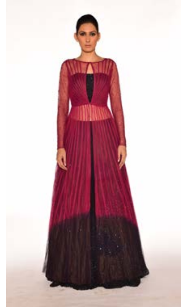
Black, embroidered lace corset top and lehenga; Boat neck shimmer net jacket, with centre front opening, Plum to black ombre, embroidered on sleeves and bottom hem.