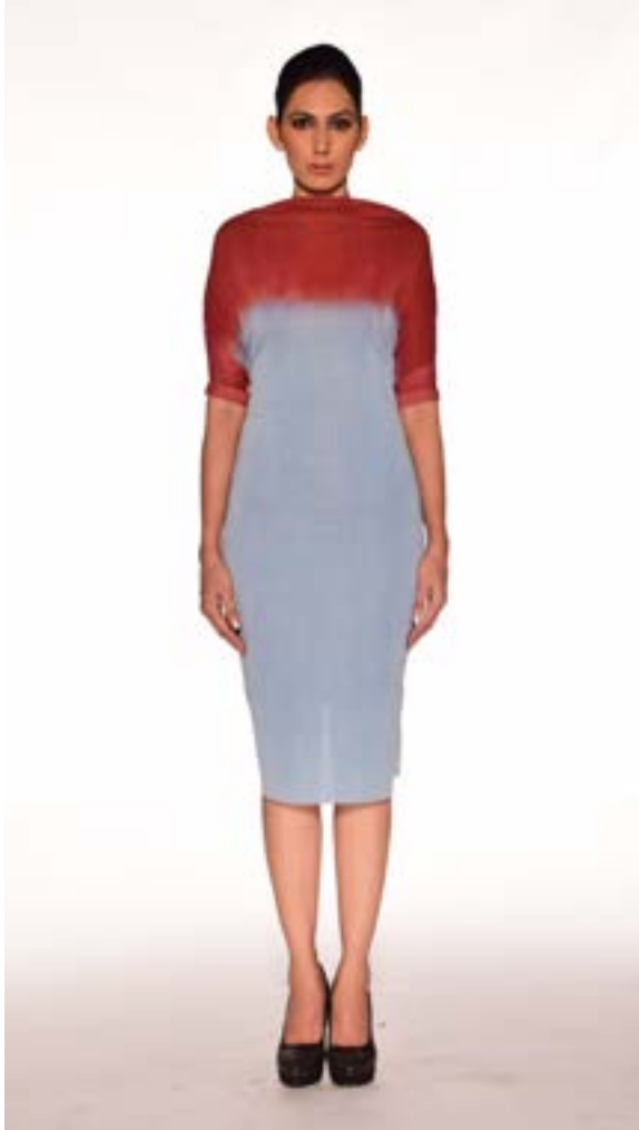
Ombre dyed knee length lycra dress with cutout back and pleated organza sleeves.