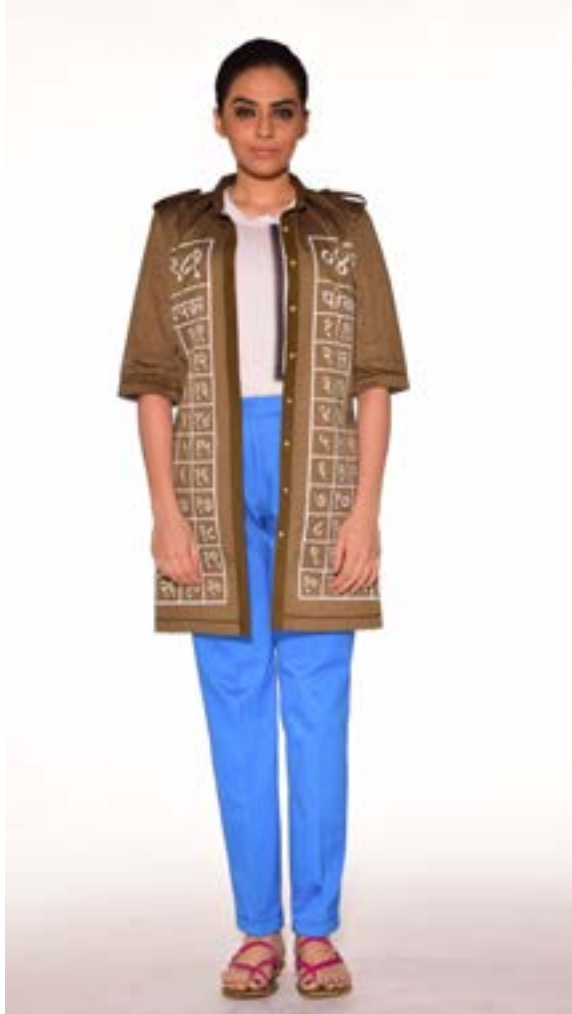
Ticket printed shirt dress paired with blue pleated pants and 'Ticket-Ticket' printed tshirt. Accessorised with colourful kolhapuri chappals.