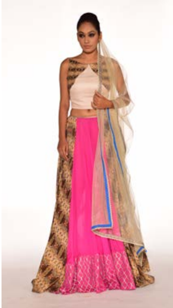
Printed and pink paneled mul-mul lehenga with kasab thread work; golden lycra tights paired with a printed and ivory boat neck top with kasab work and a dupatta drape of shimmer net with gold border edging.