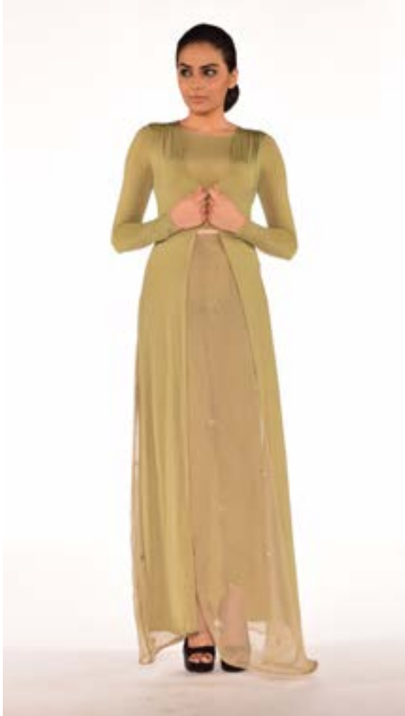
The Olive Green and the malai jersey are the perfect combination of elegance. The organza skirt adds up to the pleasant look and makes it comfortable.