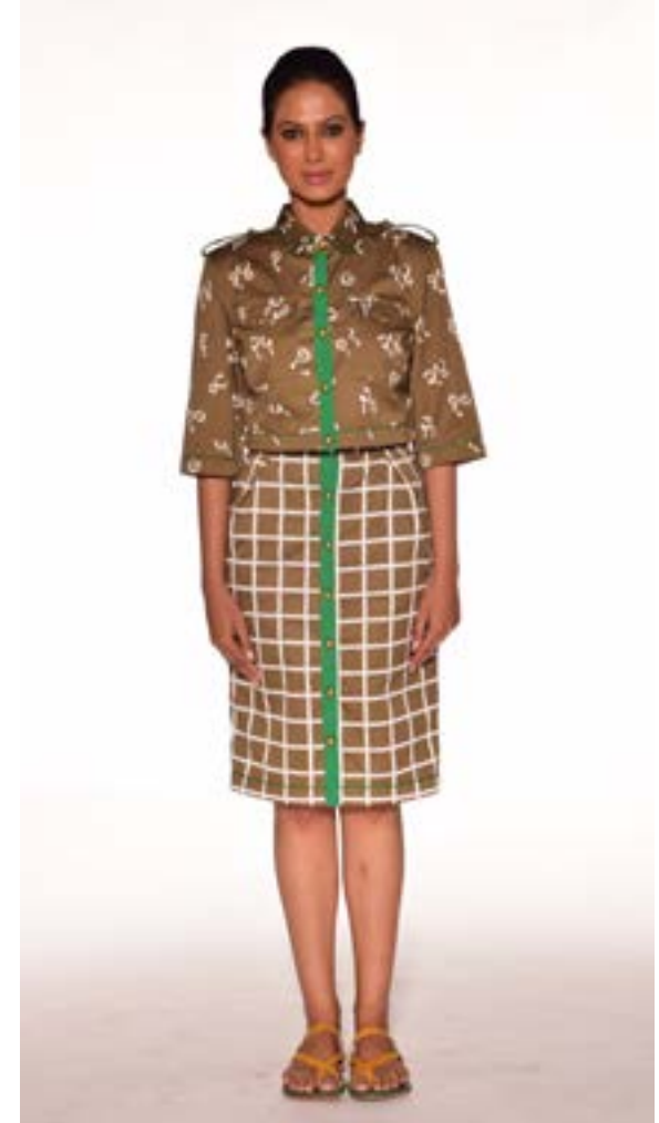
Devanagari number printed crop shirt with green trimmings and checkered pleated skirt paired colourful kolhapuri chappals.