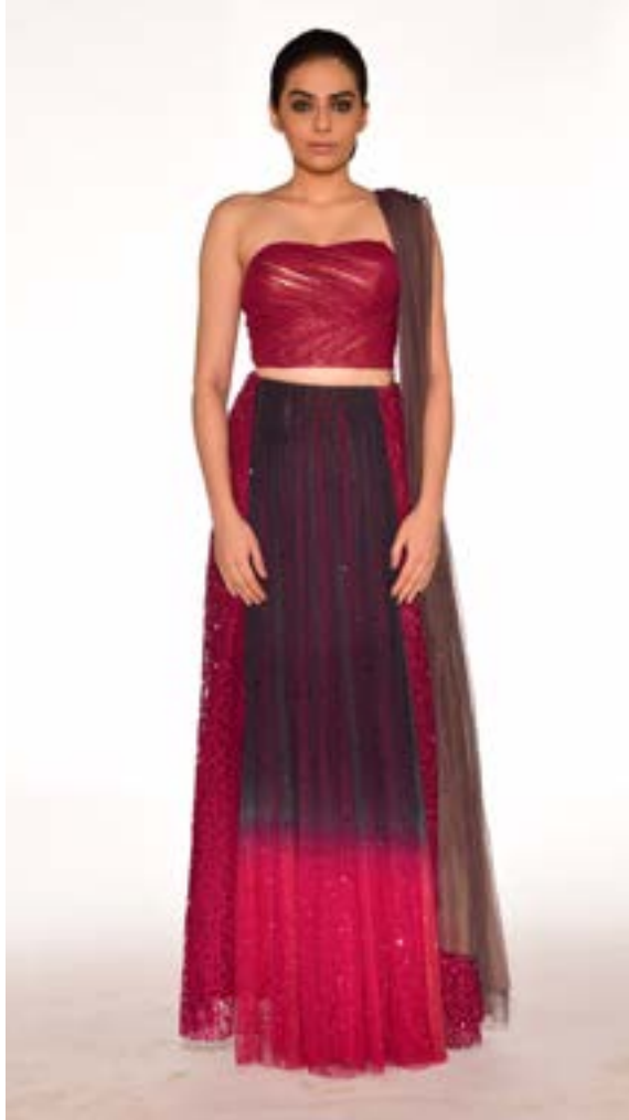
Gold sequins corset top with Plum shimmer net texturing on top; Plum lace lehenga with side panels embroidered; Embroidered net layer, Grey to Plum ombre, on centre front and centre back.