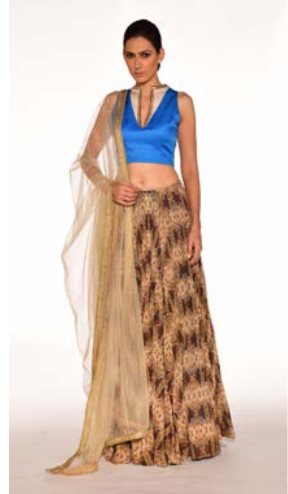
Printed and indigo blue double mul-mul lehenga with embroidery highlights of zari, zardozi, nashi, mirrors, sequins, peeta, pearls and stones, paired with a fitted indigo blue and ivory top with mirror, kasab and zardozi work; a dupatta drape of shimmer net with gold border.