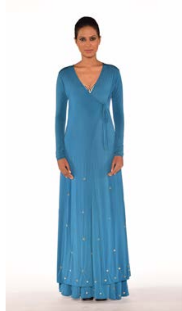
The magnificent Cerulean Blue dress with a robe like structure is pure eye candy. The dress is accompanied by a beautifully embroidered bikini.