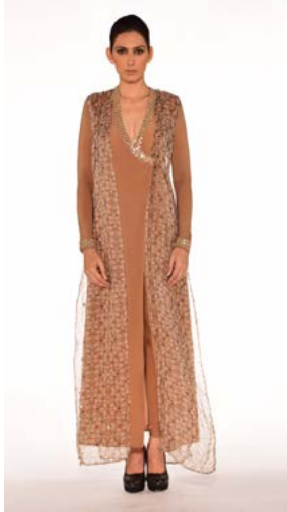
The Mustard Brown angrakha with elegant embroidery of the neck and sleeves are a tranquil combination. The embroidered cape with the print of Mughal designs praises the simplicity and gorgeousness of an angrakha.