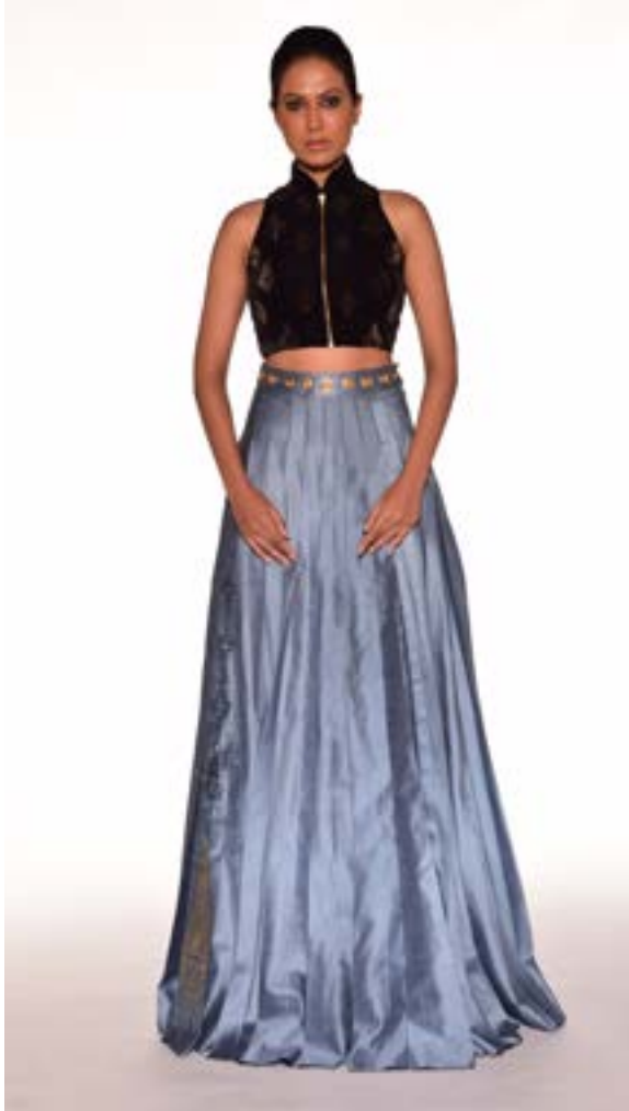
Solid construction of a high waisted box pleated skirt with a incut velvet crop top gives this garment a solid sense of style.