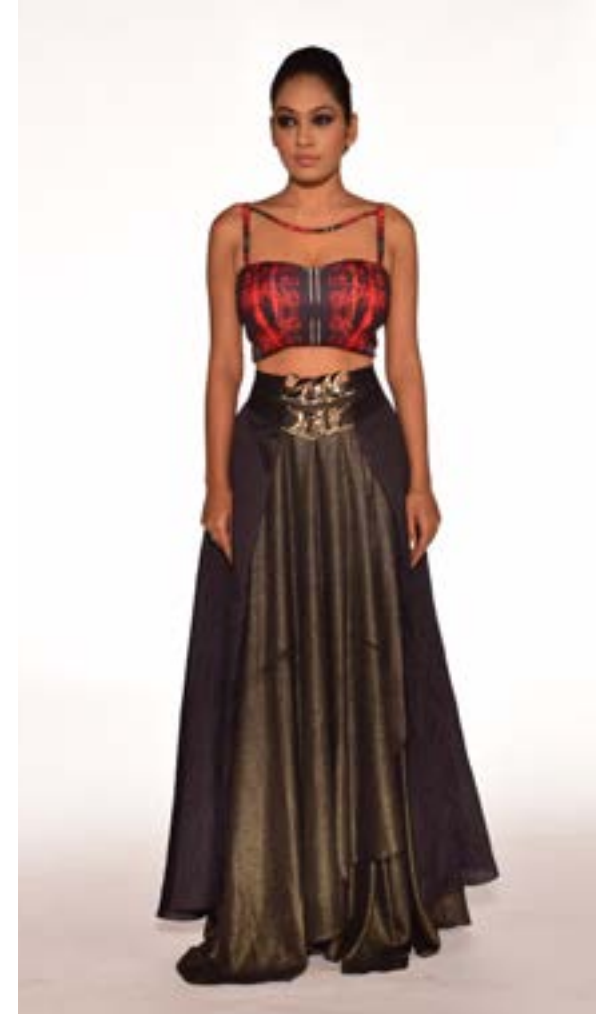
Shimmer georgette flowing skirt along with a bold saw silk skirt over it, is the highlight of this garment teamed with printed crop top that speaks fear and mystery.