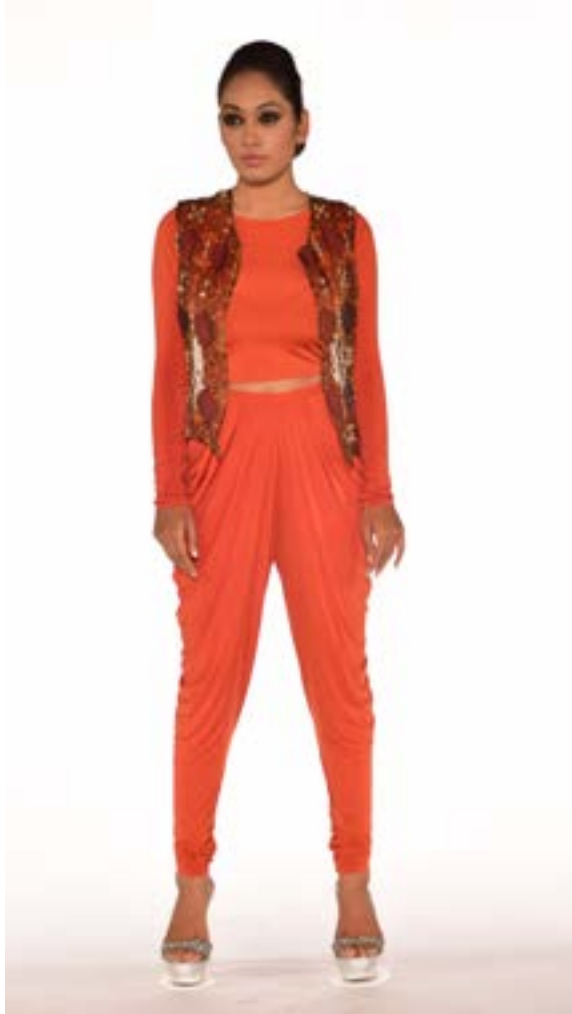
The Rust Orange design is a combination of a crop top and dhoti pants which is stylish and trendy. The embroidered jacket rests as a crown on the beauty of the dress.