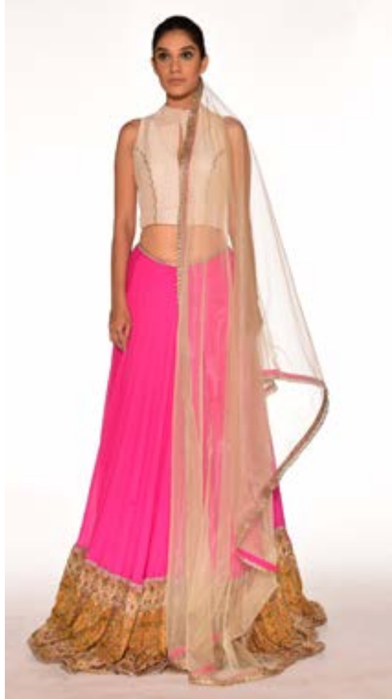
Fuchsia pink mul-mul lehenga with a printed border with embroidery highlights of pearls, peeta, zardozi, sequins and kat dana, paired with a badla embroidered linen satin top; a dupatta drape of shimmer net with gold border edging.