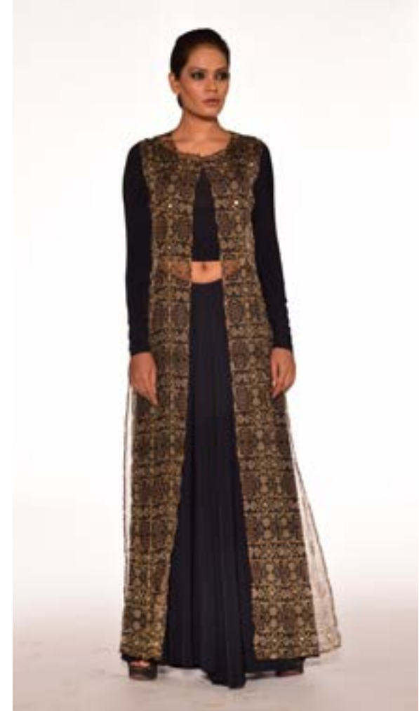
The Raven Black garment is the combination of a crop top and skirt, which is first draped in the mannequin and then stitched for perfection. The cape embraces the garment with the art of the glorious Mughal design.