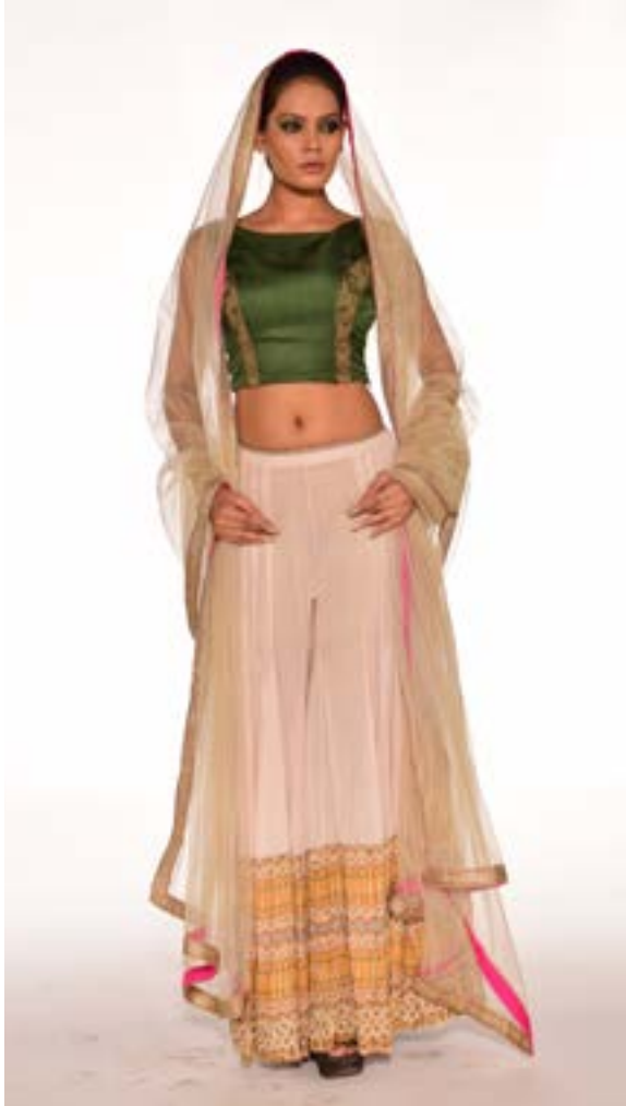
Ivory mul-mul palazzos with a printed border with embroidery highlights of kasab thread work and golden lycra tights; a fitted boat neck emerald green top with zardozi, pearls, sequins and peeta work; a dupatta drape of shimmer net with gold border edging.