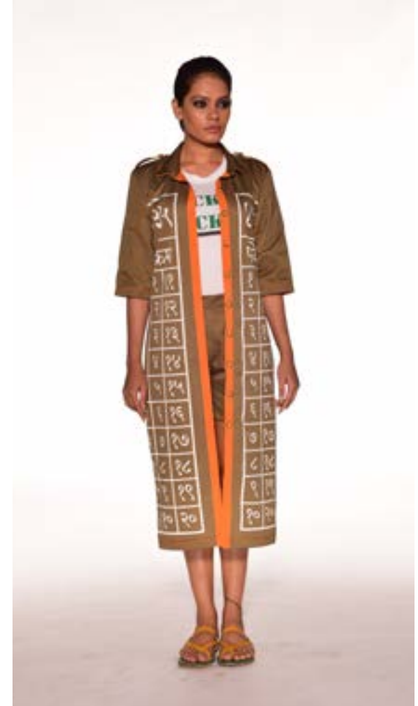
Khaki ticket printed long jacket with orange trimmings paired with khaki pleated shorts and 'Ticket-Ticket' printed tshirt. Accessorised with colourful kolhapuri chappals.