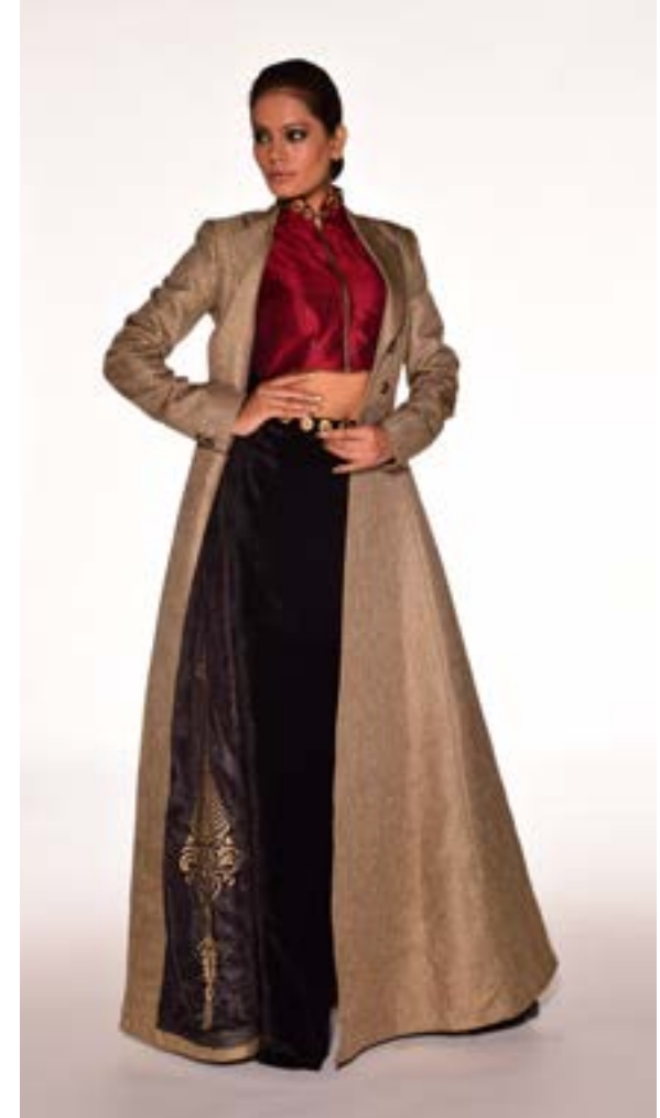
Get yourself layered with a crop top; pencil fitted skirt and a floor length trench coat above it and it will simply add to one's style statement.