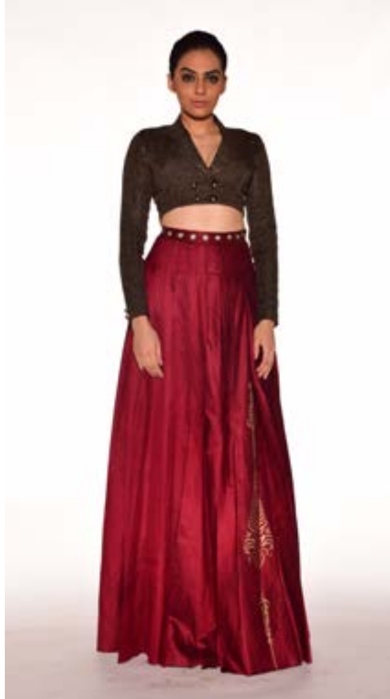
Start with a notch collar crop top of jute and add a knife pleated skirt of raw silk and you're ready to go.