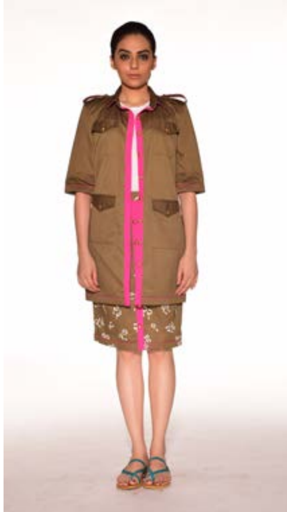
Khakhi shirt dress with pink trimmings paired with devanagari number printed pleated skirt and 'Ticket-Ticket' printed tshirt. Accessorised with colourful kolhapuri chappals