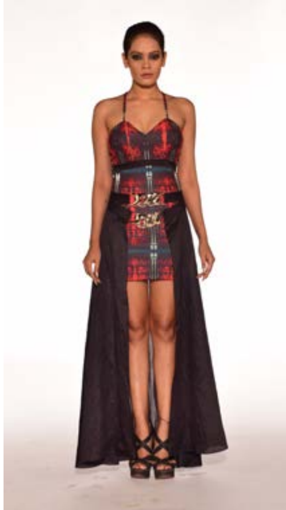
A fitted red and black print dress, dark as it can be, teamed up with an open skirt in the same print.