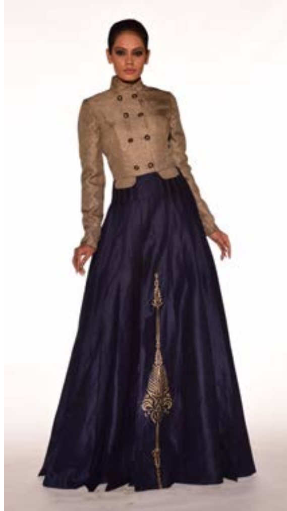
Comfortable yet fashionable is this combination of jute and innovative block printed pleated bottom which is perfect for any occasion.