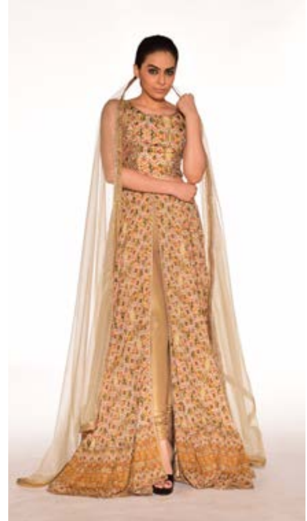
A center slit badla embroidered printed mul-mul lehenga with golden lycra tights, paired with a printed boat neck top with peeta, zardozi, mirrors, kasab, sequins and kat dana work; a dupatta drape of shimmer net with gold border edging.