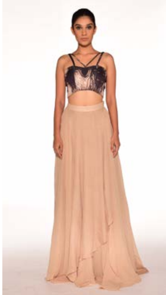
Shimmer georgette flowing skirt is the highlight of this garment teamed with printed crop top that speaks fear and mystery.