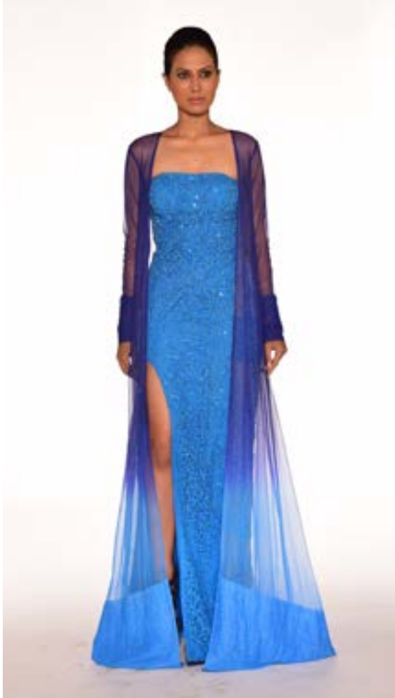
Cerulean embroidered lace corset top with a straight wrap skirt; Azure to cerulean, ombre jacket in shimmer net with a trail and texturing on bottom hem and cuffs.