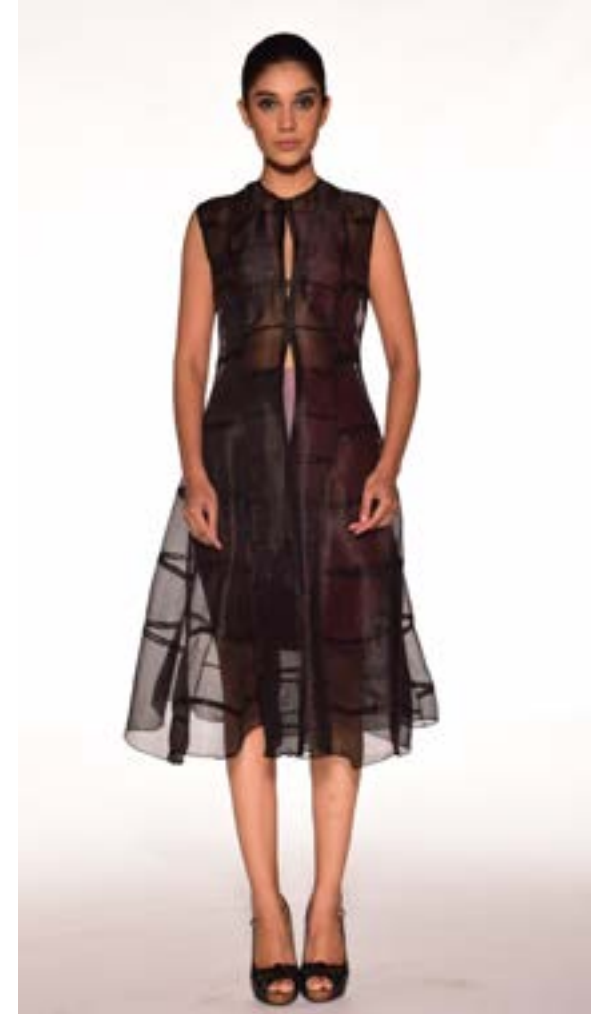
Ombre dyed knee length lycra dress with front cutout, layered with a pleated organza jacket.