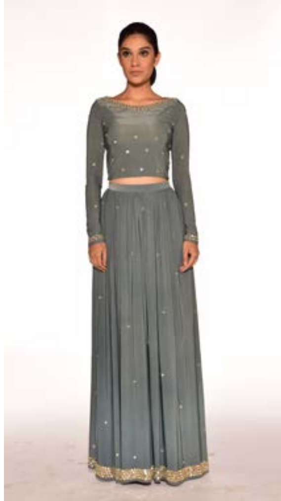
The Storm-cloud Gray is one of the most beautiful shades of gray. The dress is a combination of a crop top and a gathered skirt that is accompanied with a lot of mirror work that happens to be my personal favourite.