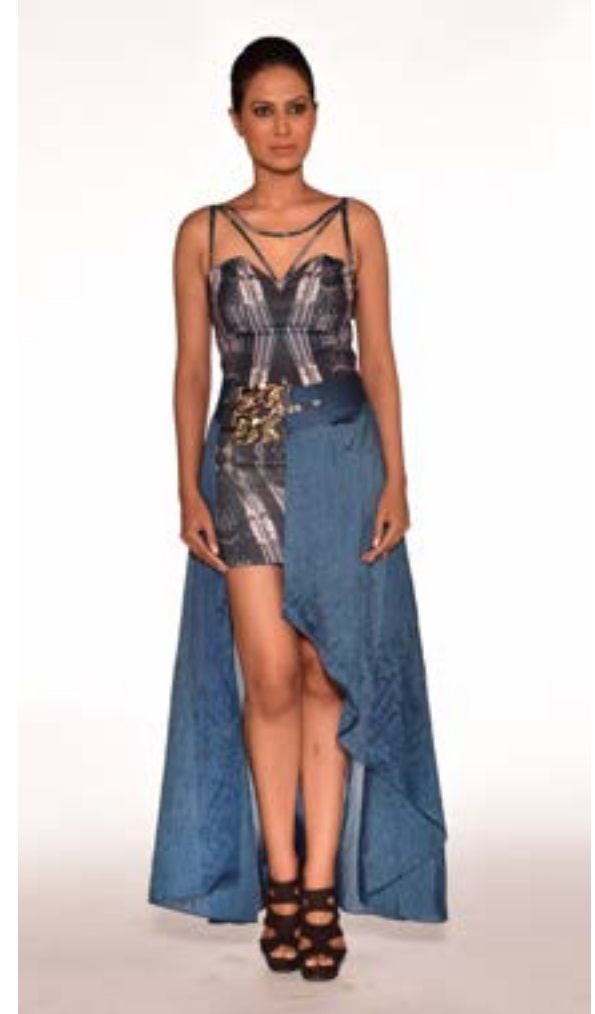
Mustered lycra outfit, print inspired by the gate of a gothic building with intricate necklines teamed with raw silk open buckled skirt.