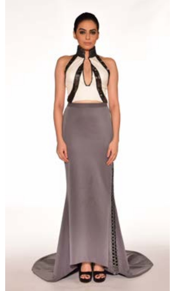
Racer back top paired with metal stand collar and deep cut rectangular neckline paired with mermaid skirts accentuates every curve. Metallic embellishments and mermaid skirts. Heavy armour-like metal embroidery adds an extravagant feel to it.