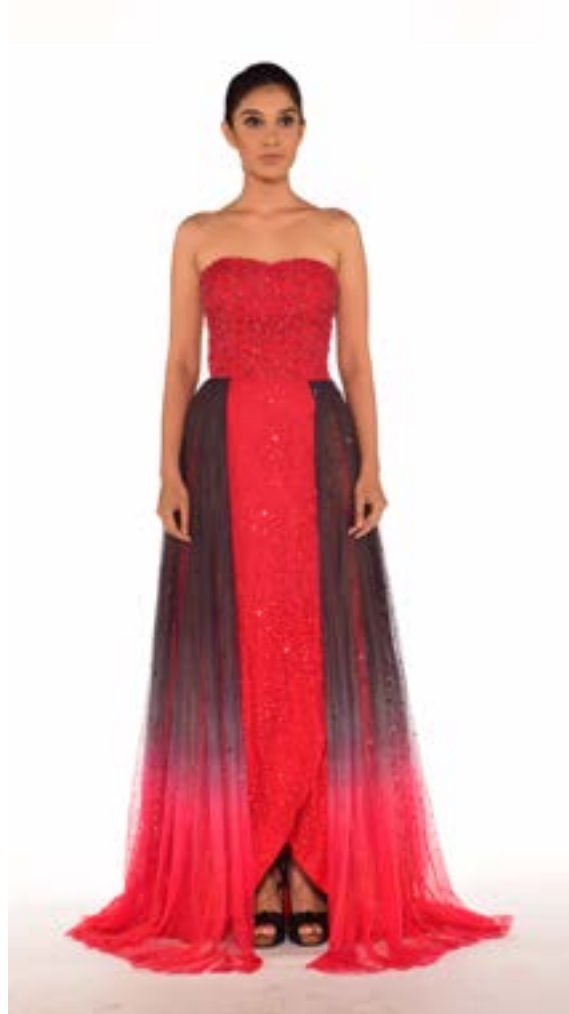
Scarlet embroidered lace corset top with a wrap skirt; Black to scarlet ombre, embroidered shimmer net skirt with centre front opening and a trail.