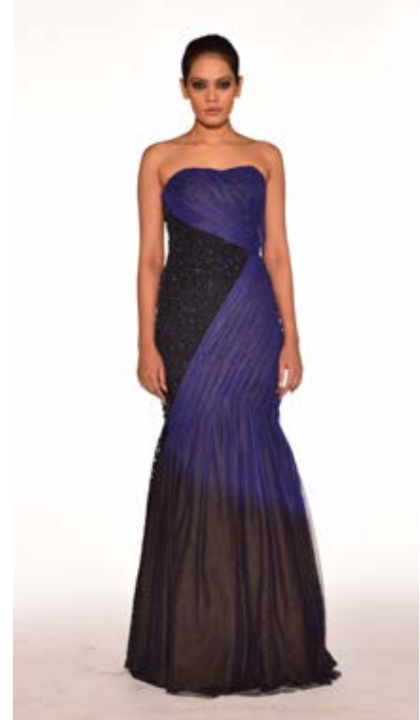
Black embroidered lace in fishcut style with a diagonally pleated shimmer net drape in Azure to black ombre.