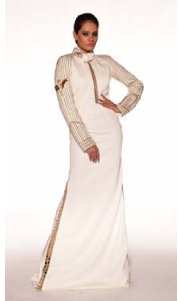
Backless body hugging ivory gown with deep rectangular neckline is fused with square shouldered raglan sleeve Jacket which gives a powerful feel. Dull gold embroidery on ivory with Russian two faced seal emblem on sleeve composed with metal elements.