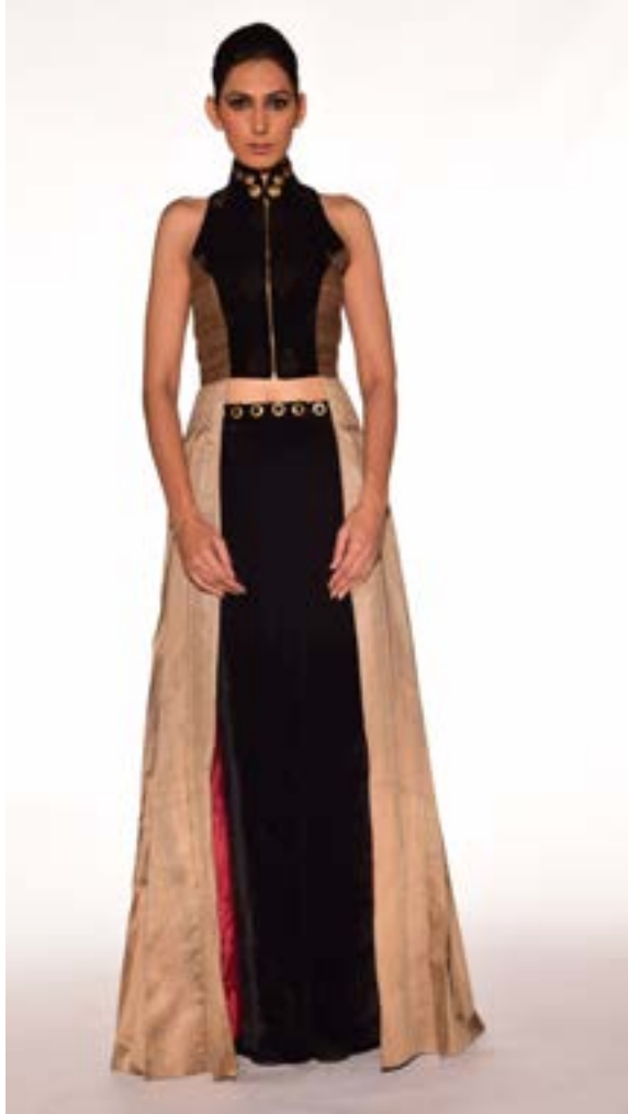
Dress to impress with this innovative fusion of box pleated kurta jacket combined with a velvet pencil skirt.