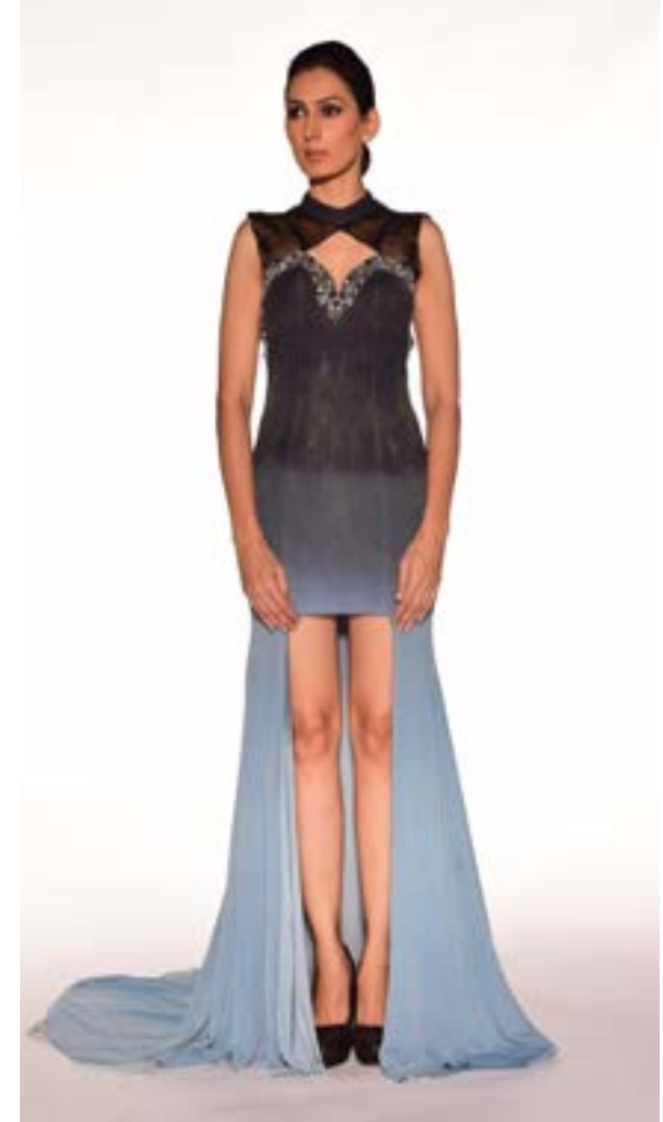
Ombre dyed lycra gown with cutouts having pleated organza full sleeves; enhanced with stone embroidery.