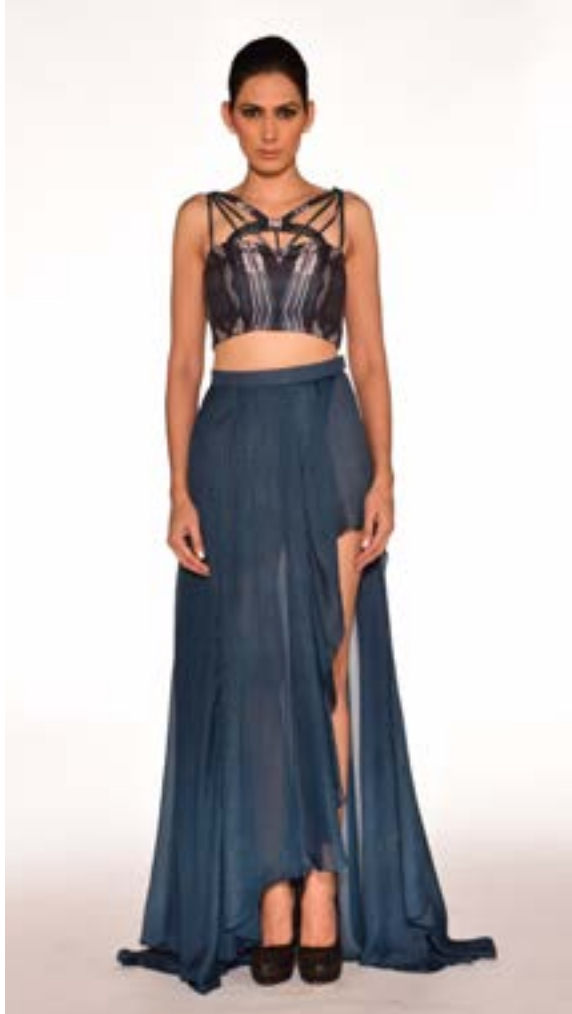
Shimmer georgette flowing skirt is the highlight of this garment teamed with printed crop top that only screams goth architecture.