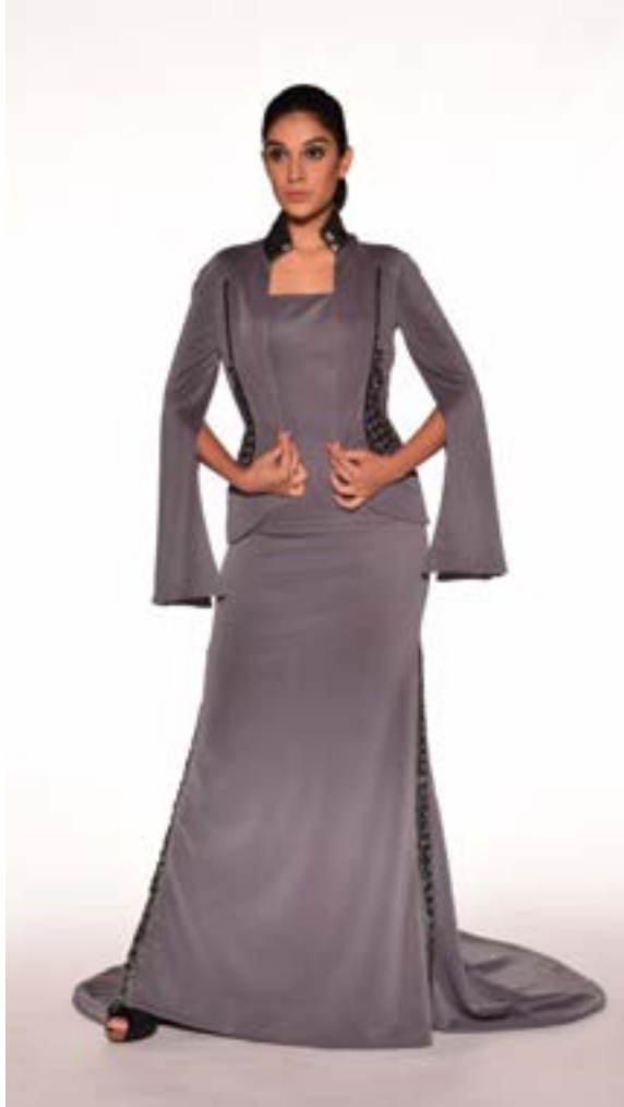
Soft tube metal grey fitted gown blended with structured and heavily metal embroidered cape sleeved Jacket with T-shaped revealing back states a very sexy feminine yet bold feel to it.