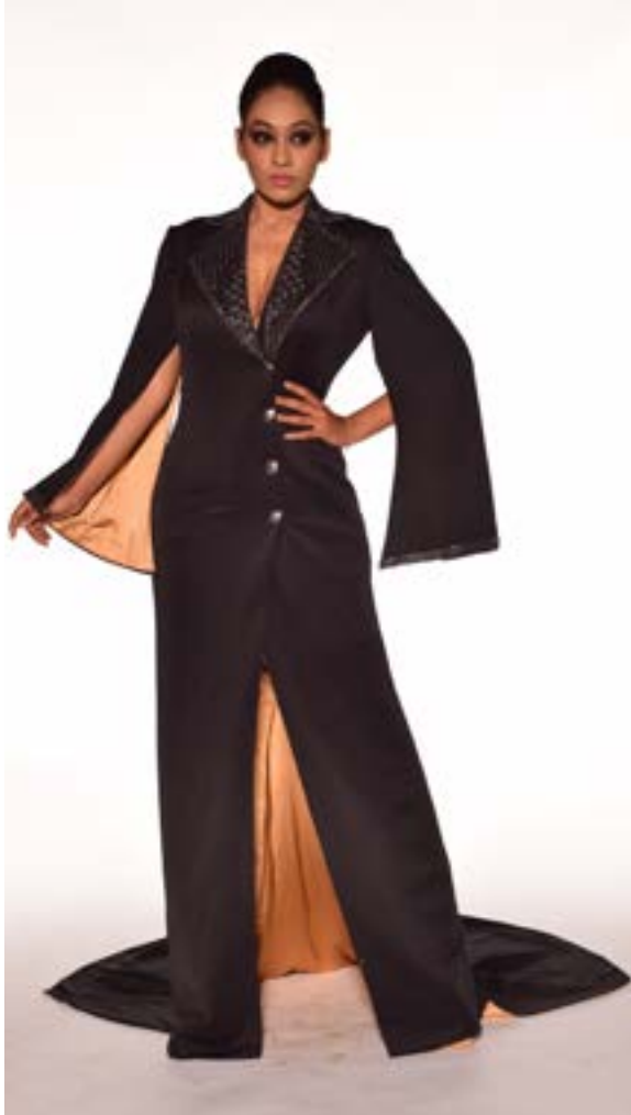
Simple yet sexy thanks to that low neckline, and the wide row of buttons on the front giving it a hint of a Jacket with wide embellished lapels and strong shoulder pads. Peeled off back with eye catching all over metal and crystal belt.