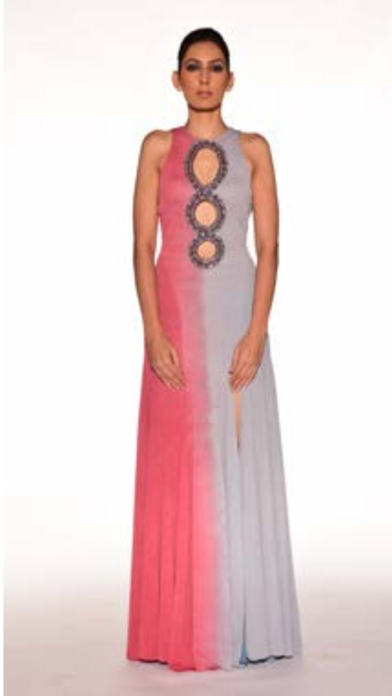
Ombre dyed lycra gown with cutouts enhanced with stone embroidery.