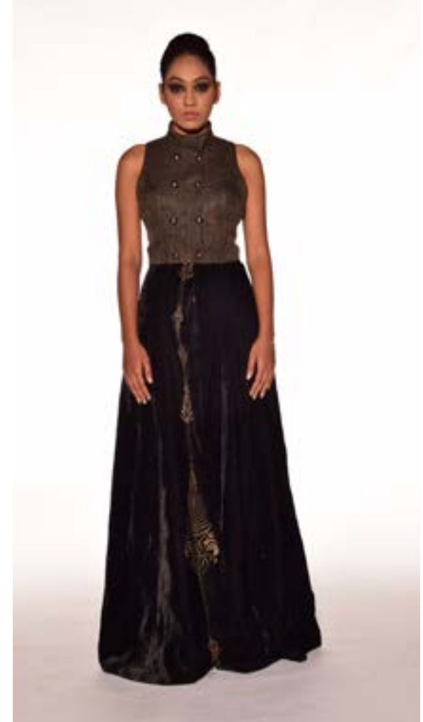
Light up your look with this overlapped jute - velvet block printed, mandarin collar gown.