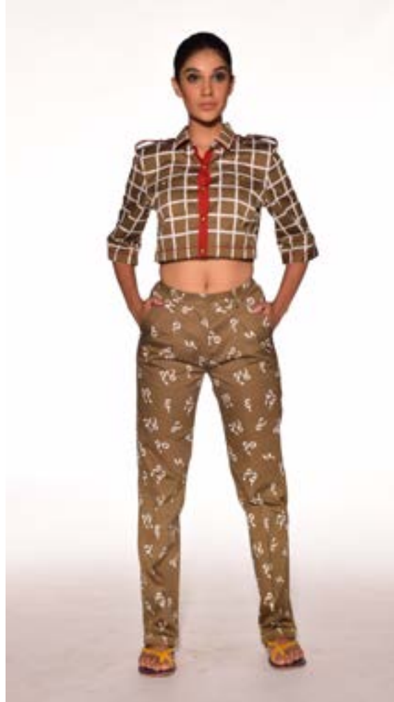
Checkered crop shirt with red trimmings and devanagari number printed pleated pants paired with colourful kolhapuri chappals.