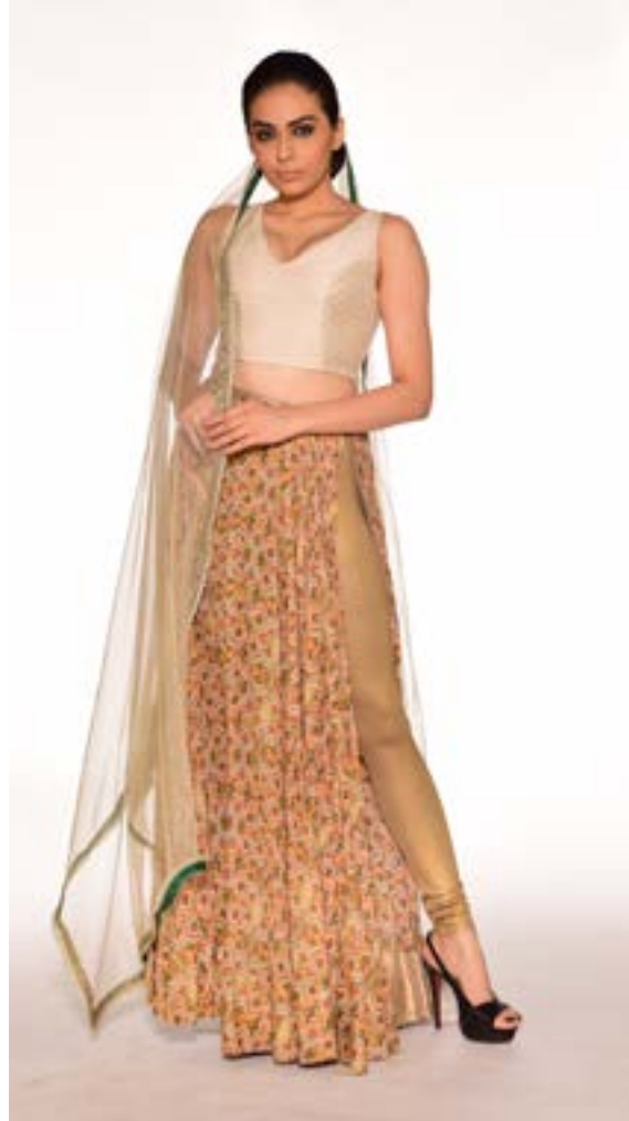
Side slit printed mul-mul lehenga with embroidery highlights of peeta, sequins, nakshi, pearls, mirrors, kat dana and kasab; golden lycra tights paired with a fitted V-neck ivory top with kasab thread work and a dupatta drape of shimmer net with gold border edging.