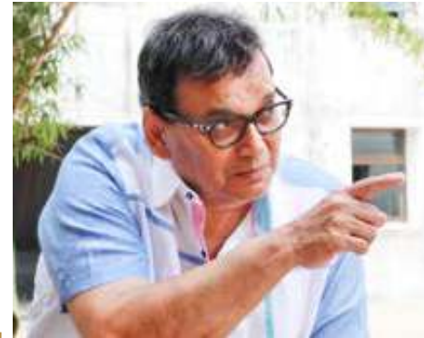
Subhash Ghai Founder & Chairman Whistling Woods International

Established in 2013, Whistling Woods Neeta Lulla School of Fashion is a joint venture between renowned filmmaker, Subhash Ghai and legendary fashion designer, Neeta Lulla. Whistling Woods Neeta Lulla School of Fashion is the first-of-its-kind Film & Fashion school created by the industry, for the industry. This venture aims to provide relevant practical training and in-depth industry knowledge to fashion aspirants across the country.